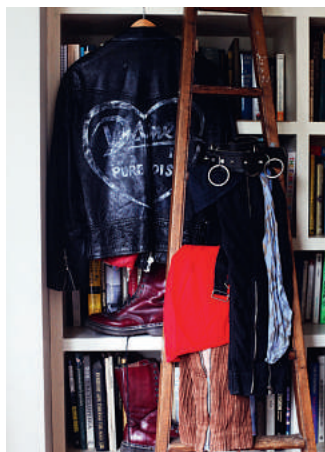
Caryn's closet is an archive of 20th-century style

Franklin's own closet functions as a potted history of late 20th-century style: