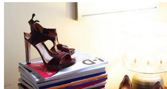
Caryn's London vintage hotspots: 1. Rellik, Westbourne Park (relliklondon.co.uk) 'My go-to store for discerning designer cast-offs.' 2. Stables Market, Camden

Words: Kerry Potter; Photography: Laura Allard-Fleischl.